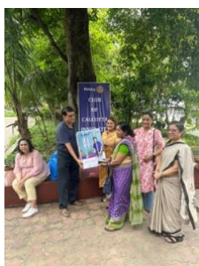
Handing over water purifier