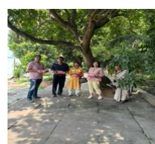
Members enjoying the serene environment of Gobindo Home