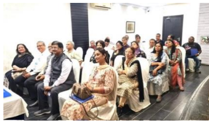
Members at RWM