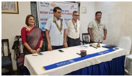
President, Secretary of Innercity & Endeavour