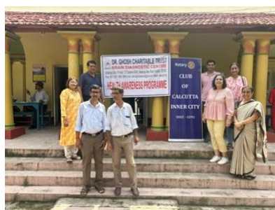
Health check-up camp at Gobindo Home