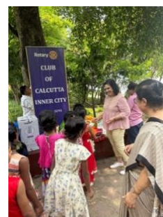
Girls of Gobindo Home being given new clothes and snacks by Innercity members